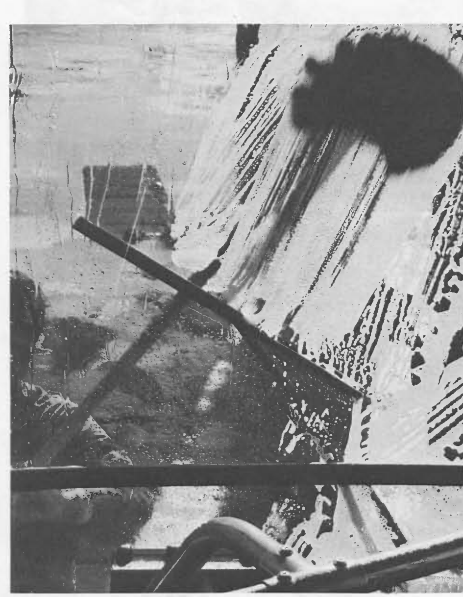
First Place, Semi-Professional, Bill Reason

More Winning Photos (continued from page 2)