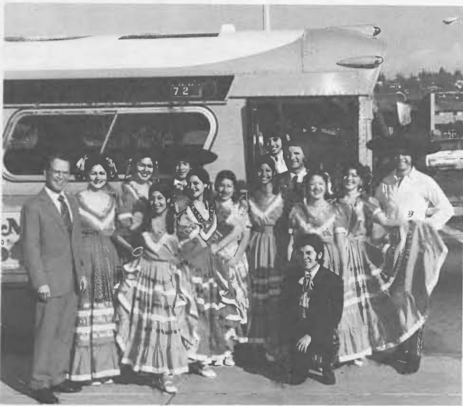
The inauguration of the East Los Angeles Grid service on Monday, January 26, was marked by Mariachi music and the Ballet Folklorico.