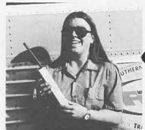
THE LADY IS A HAM—