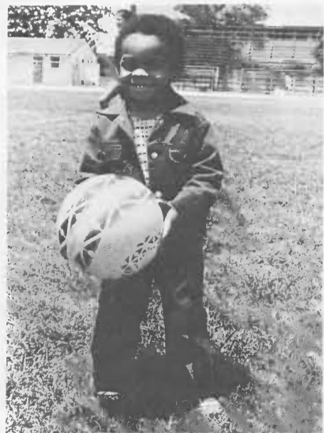
"A BIG SMILE FOR A LITTLE GUY" — Why is this little guy smiling? Because he went to the RTD Annual Family Picnic on Saturday, June 12, and had a very good time. For pictures and story, see Page 3.

He is also currently Chairman of the Los Angeles Junior Chamber of Commerce Civic and Governmental Affairs Committee and President of the San Gabriel Valley Eagle Scout Association, and has served as president of the Merlinda Elementary School PTA in West Covina.