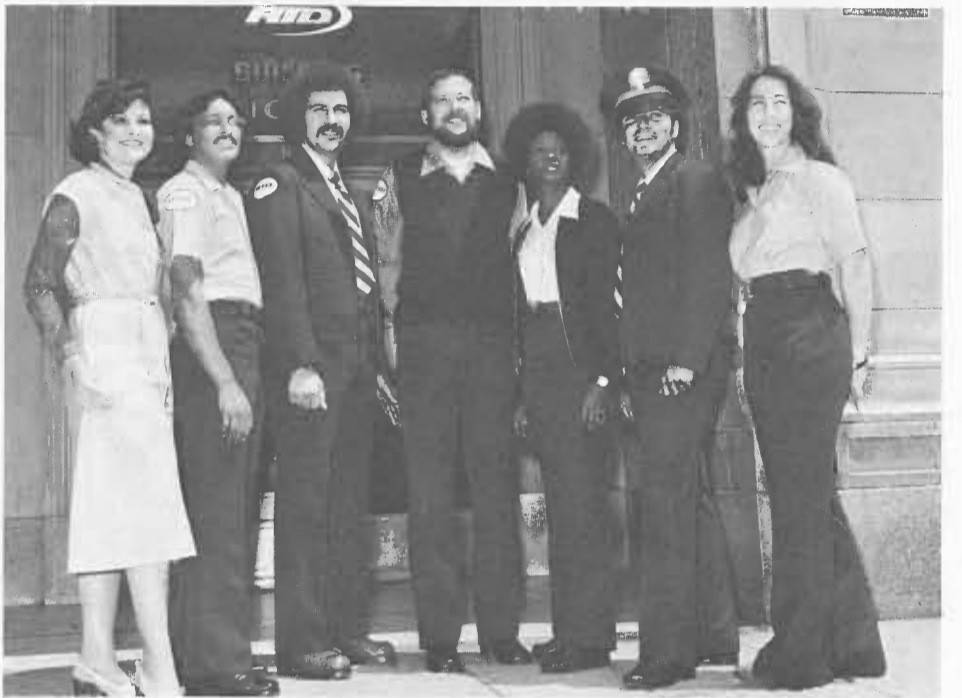
The six operators, whom everybody agreed did an excellent job, later posed outside the old Transit headquarters at 1060 So. Broadway for a picture session — just like real models.