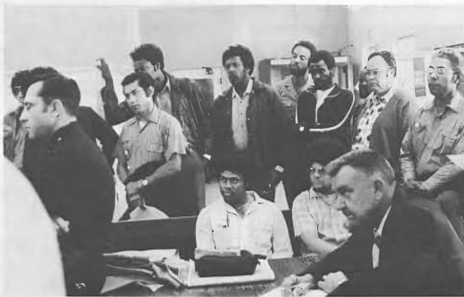
Division 2 operators listen during a well-attended rap session. Featured at the rap session were two L.A.P.D. officers who explained 'Operation Ride-Along', an undercover surveillance program to stem the incidence on vandalism aboard buses.