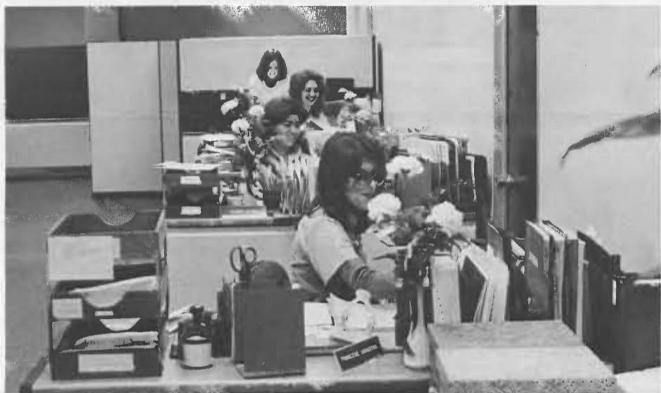
FLOWERS FOR THE LADIES. Numerous secretaries' desks throughout the District, like those above at Transit Headquarters, blossomed with flowers during the recent National Secretaries' Week as secretaries were presented with flowers by their bosses in appreciation for their work during the year.

This newly designed form is part of the revised Operating Employees Service Guide Up-date, sections of which have been issued to operators, with the remaining sections to be completed within the next 30 days. In issuing the new Service Guide, a sincere effort has been made to rely on the good judgment of the operator in handling the many unusual problems that arise during the normal tour of duty. The "Passenger Dispute Card" should prove to be a helpful tool in this area.