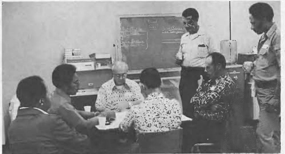
There were many tense moments during the tournament including such as the one above, where the spectators watched just as intently as the players.