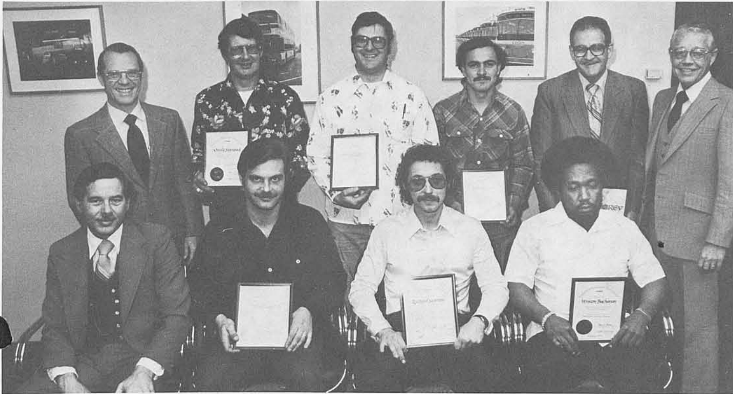
GRADUATION—The eighth class in the Mechanic Training Program received certificates of completion and congratulations from District officials in ceremonies held in the Executive Conference Room at District Headquarters. Pictured above are (front row, left to right) President of the Amalgamated Tran-