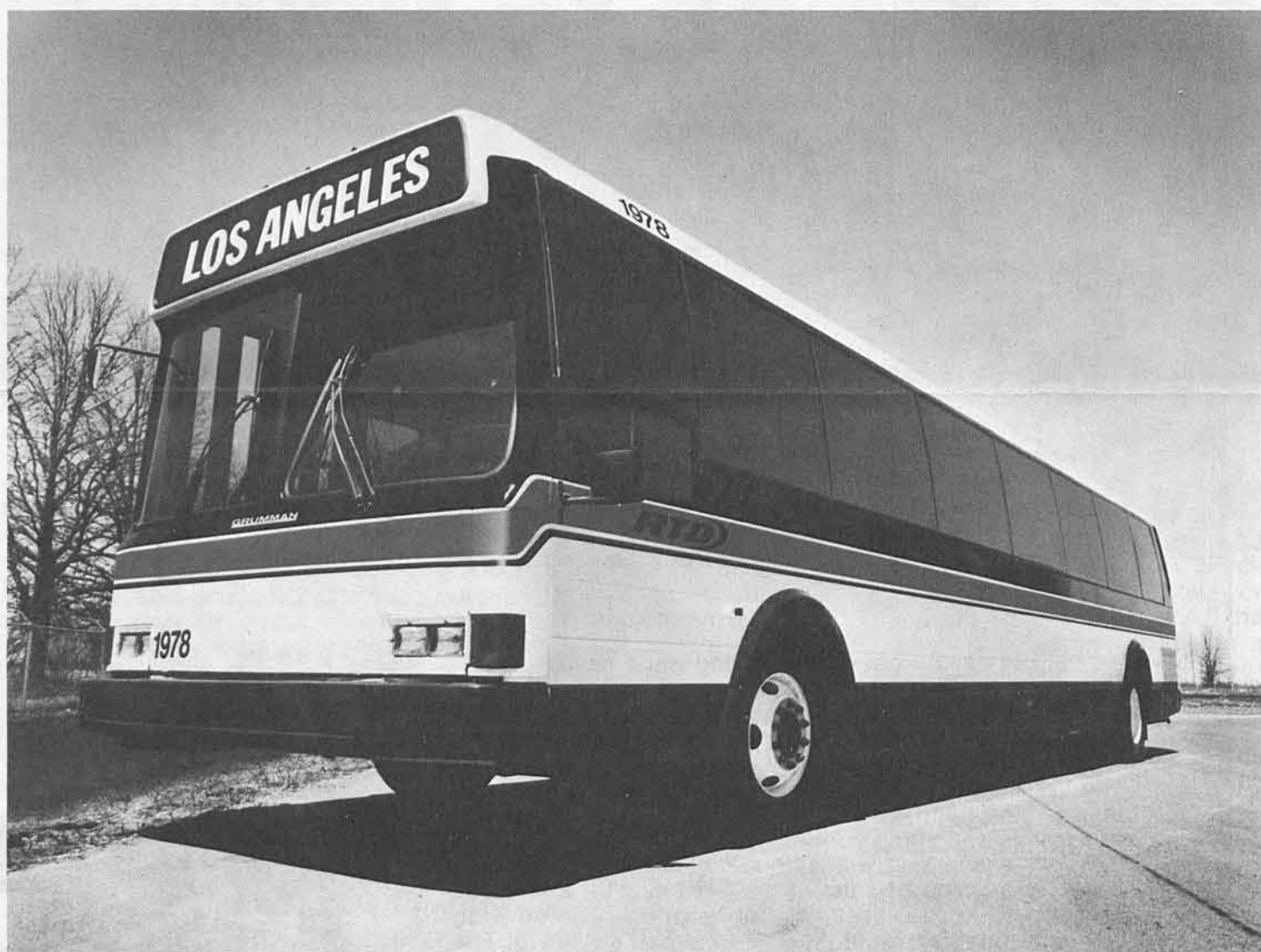
ON THE WAY — RTD has awarded a multi-million dollar contract to Grumman Flxible for 230 of these advanced design buses. The 40-foot long bus seats

authorized by the board, calling for the purchase of 1,200 new buses over the next three years to improve the RTD's fleet. Plans for the acquisition of those new buses may be in trouble, however, as the Urban Mass Transportation Administration (UMTA) has told the District that only half as much federal money may be available.