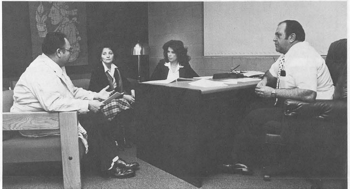
PALAUVER — Part of the Visiting Nurse Program is explaining the concept and procedures to division managers. At Division 5 recently, Maintenance