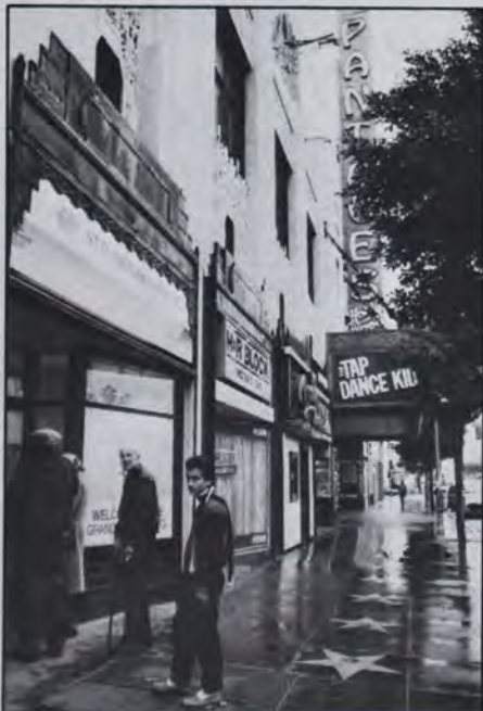
RTD back on the walk of the stars.