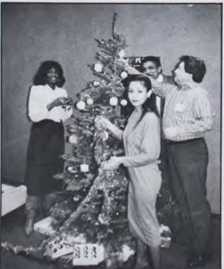
Third floor tree trimmers created the "Most Inspirational."