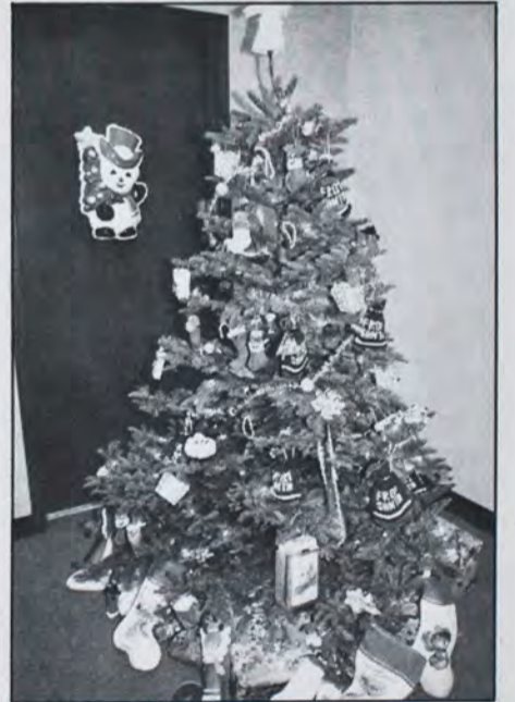
Fifth floor tree.