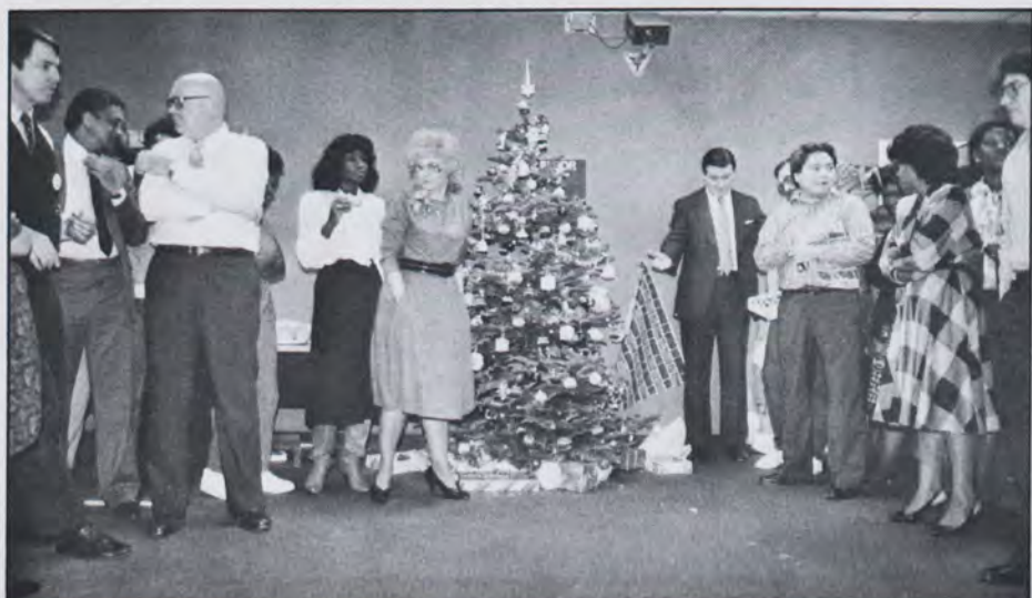
Third floor employees.