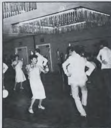
Employees perform the Pandango sa Ilaw at Filipiniana Night.

The dance, Pandango sa Ilaw or Dance of the Lights, is a Filipino folk dance of courtship. Each woman dances carrying two candles while balancing a third on her head. The candle on the woman's head is meant to symbolize the male's heart. Through the dance she is encouraged to take care of it and not let it break—both the light and his heart.