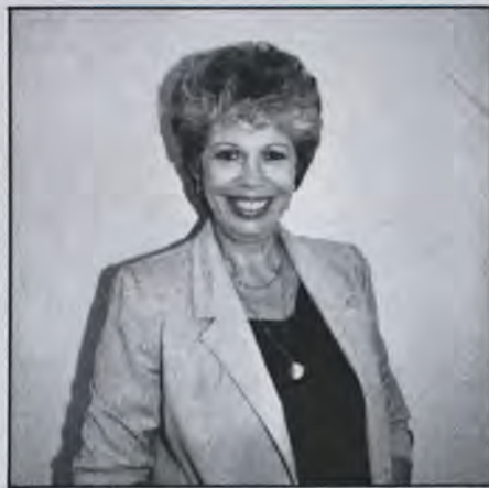
by Elia Hager Visiting Nurse

Look for lightweight and insulated clothes. Use the multilayered approach to your clothes, i.e., a camisole, a turtleneck, a sweater, then a jacket. Avoid constricting your waist,