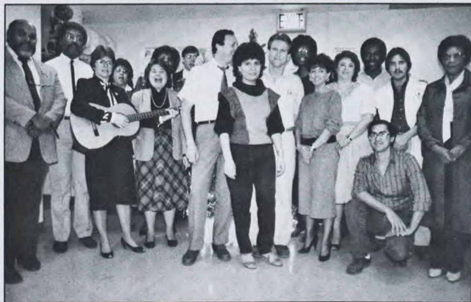
Basement tree trimmers sing Christmas carols.