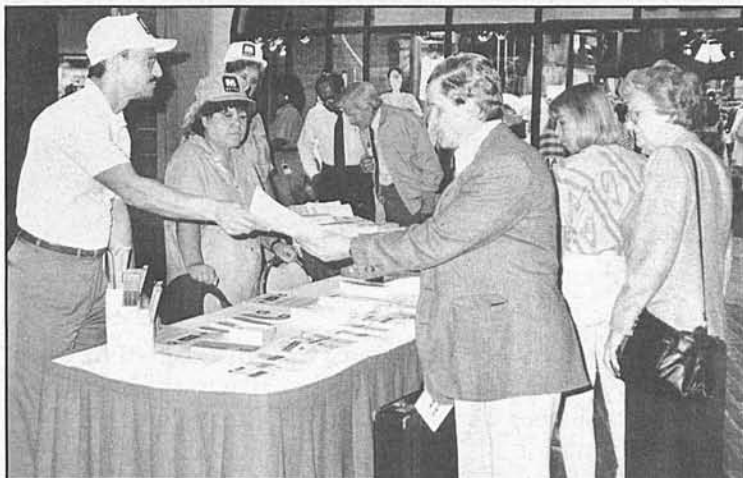
GETTING THE WORD OUT — Shoppers at the Broadway Plaza in downtown Los Angeles pick up information about the opening of the new station during a special RTD promotion.