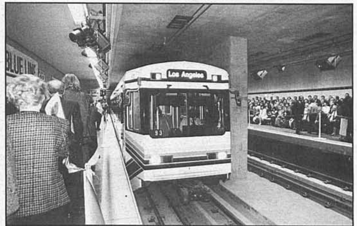
DOWN UNDER — Invited guests crowd the underground platform as the first train gets ready to pull out of the station.