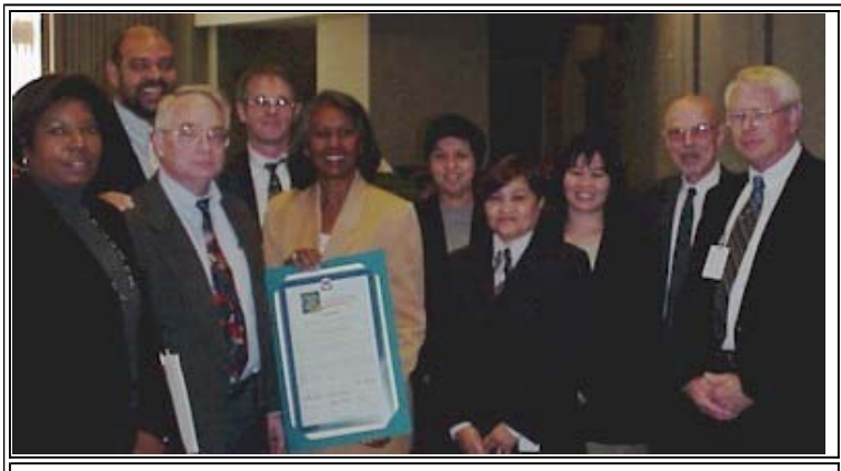
The Y2K team was on hand to receive the MTA Board's congratulations for a job well done.