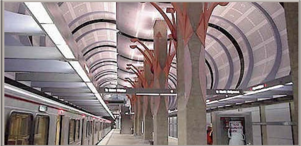
In the heart of Hollywood's historic district, Hollywood Boulevard will be closed for a Saturday session with the hot new jazz club, the Knitting Factory, at the Hollywood Highland Station .