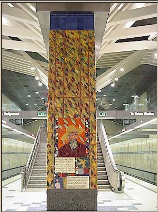
At the Universal City Station , appetizing samples of thrills and fun will abound courtesy of one of the world's most popular theme parks, the Universal Studios Tour and City Walk.