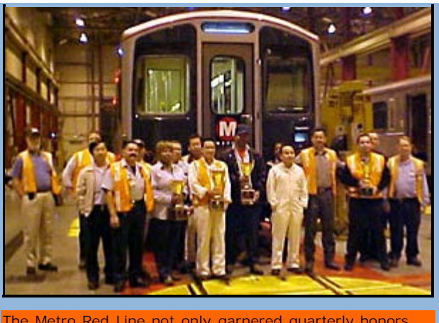
The Metro Red Line not only garnered quarterly honors, but also was rated best rail line for September and October.