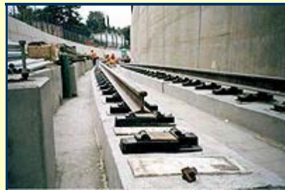
Crews work on the track installation in the north portal of the Figueroa grade separation.