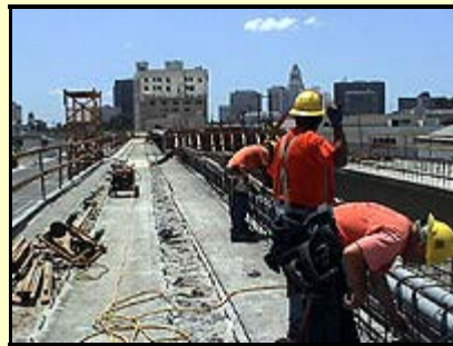
Construction workers tie reinforcing steel for the emergency walkway on the Chinatown aerial structure.