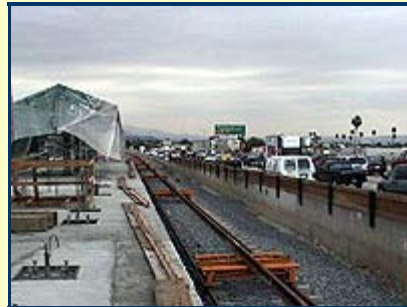
Plastic covers a freshly painted structure on the station platform at the Sierra Madre Villa station.