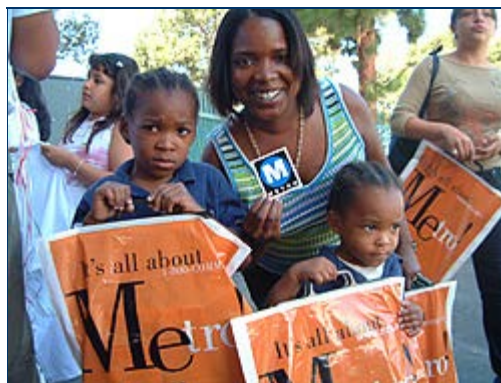
Family with Metro promotional materials during Fiestas Patrias at Hollywood Park.