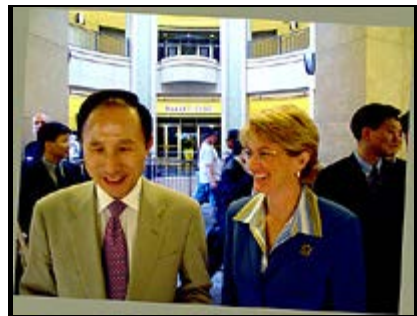
It's the home of the Oscars