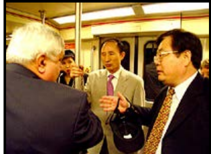
Riding the Red Line