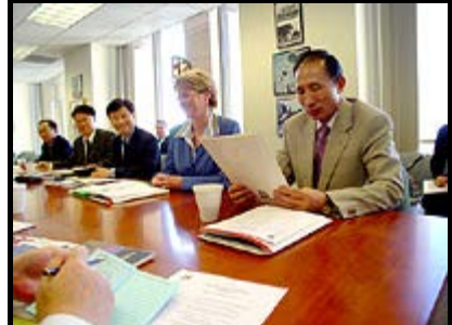
Briefing at Headquarters