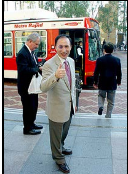
Ready to Roll