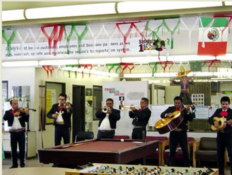
Mariachis lead celebration at Central City Division.

(May 13, 2003) In celebration of the Cinco De Mayo holiday, Gateway Cities and Westside/Central Divisions 1, 2, 6, 7 and 10 held parties throughout the week.