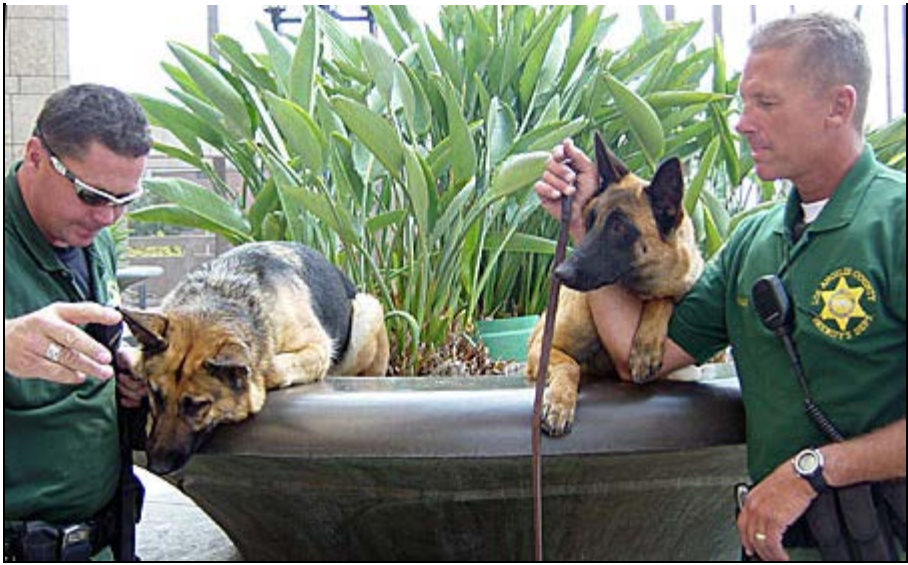
The LASD Canine Services Detail handlers are still getting the dogs accustomed to their new surroundings.

The Canine Services Detail teams have been at Metro for only three weeks and the handlers are still getting the dogs accustomed to their new surroundings.