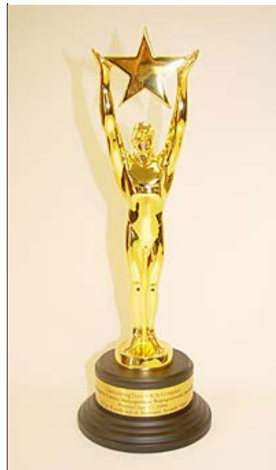
The VICA "Excellence in Business" award is inscribed with "Outstanding New VICA Company: Los Angeles Metropolitan Transportation Agency."