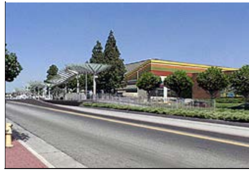
Rendering> Simulated East L.A. Civic Center Station

"These are tough economic times and regions across the country are competing vigorously for a share of a shrinking pot of federal money," said LA City Councilman Antonio Villaraigosa. "I am pleased that Congress and the FTA have recognized how much this project will improve the lives of thousands of people who live and work in the area this line will serve."