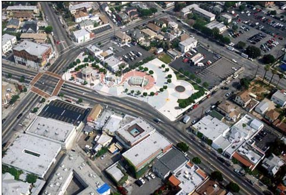
Rendering> Simulated Boyle Heights Mariachi Plaza Station