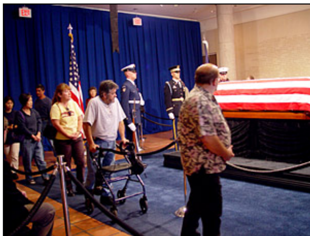
A solemn procession of people from all walks of life circled the former President's casket hour after hour and throughout the night.