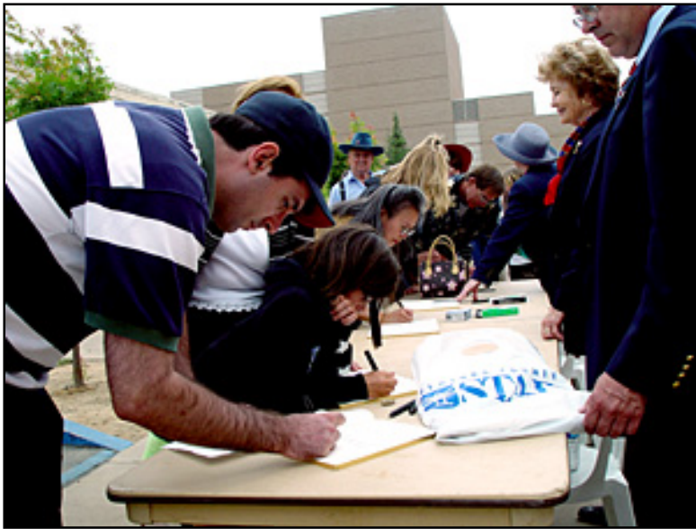
After paying respects to the President, many mourners stopped to sign the condolences book.