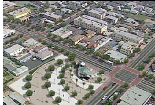
Rendering> Simulated Soto Station