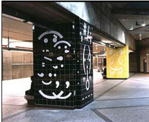
"No Title" by Bob Zoell , platforms of Wilshire/Vermont Metro Rail Station.

Artist Bob Zoell has abstracted the appearance and arrangement of typographic design symbols to create a bold and graphic series of ceramic tile murals. The artwork covers four columns at station platforms: two on the upper level and two in the lower. The artist worked carefully to establish an animated and playful dynamic between his characters. Text appears to dance at it's own happy pace, while other figures run off kilter as if ready to jump off the columns to greet commuters.