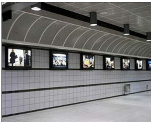
"Photographs on the DC Subway" by Andrew Z. Glickman : Seven illuminated photo panels on the mezzanine level of the Wilshire/Normandie Station.

Andrew Z. Glickman uses photography to document how subway passengers behave among total strangers. In train cars with ample space, passengers position themselves at carefully calibrated distances from their neighbors. However, once that space has been established they begin to relax and act as they might do in the privacy of home. Glickman prefers to work unnoticed using a 35mm rangefinder camera with a silent shutter and without a flash.