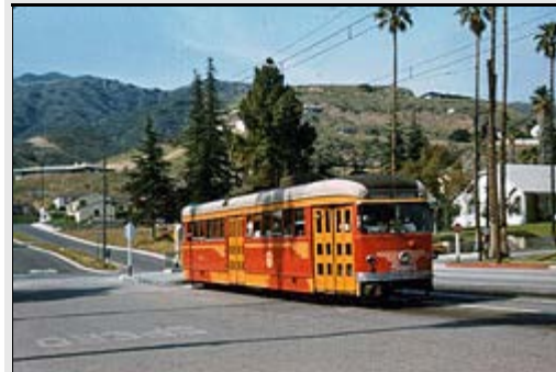
Line 5001 sails down Brand Blvd. at Mountain Ave. on a smogless day in Glendale, June 4, 1955.