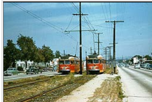
Lines 5014 and 5025 pass on the tracks along Glenoaks Blvd. at Sonoroa Ave., June 4, 1955.