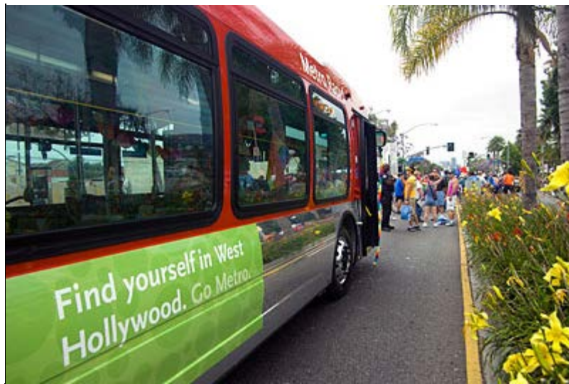
Spectators found themselves reflected in king ad that included a mirror.

Metro went all out for the annual Christopher Street West Parade in West Hollywood this year, decking out the Metro Rapid bus with a special West Hollywood king ad, tail ad and banner prepared for the parade by Metro's Design Studio.