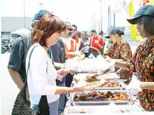
The smell of barbecue wafting over the Division 20 yard drew a long line of hungry Raildeo Celebration participants for ribs, hot links, burgers, beans and potato salad.