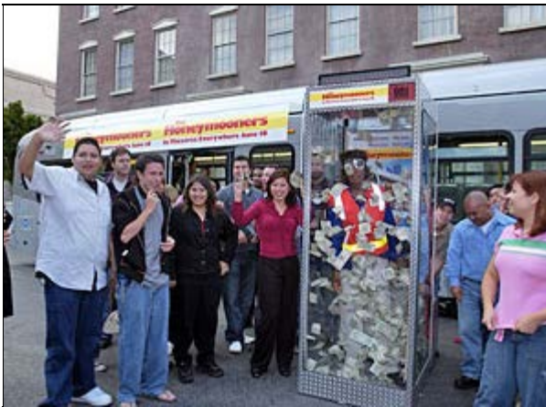
Winners of an on-line contest got the chance to step into a wind-filled booth to grab for cash and rode the Metro Liner into the studio's New York set.