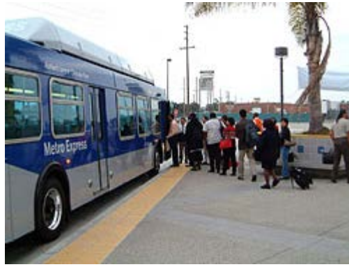
Passengers board the new Metro Express line at the Artesia Transit Center, bound for downtown Los Angeles