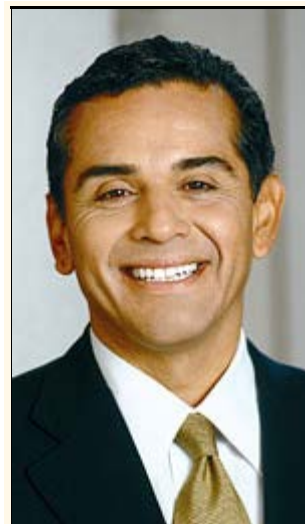
Los Angeles Mayor-elect Antonio Villaraigosa will be sworn in as chair of the Los Angeles County Metropolitan Transportation Authority Board of Directors in July.

The 13-member MTA Board is composed of the five LA County supervisors, four members appointed by the LA County City Selection Committee, and the Mayor of Los Angeles and three mayoral appointees. The position of Board chair rotates among the three groups.