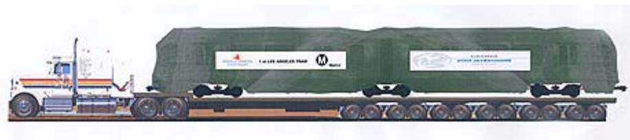
Illustration shows the flat-bed truck that will transport Metro's 2550 rail car to the Metro Gold Line yard. The rig has all-wheel steering in order to more easily maneuver through streets to the rail yard.

On Saturday, Metro officials, local officials and AnsaldoBreda executives will welcome the 90-foot, 54-ton rail car to Los Angeles.