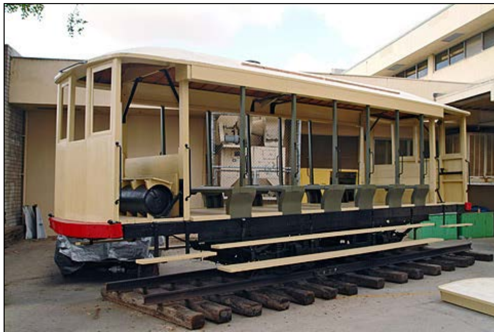
The 1890s streetcar in pristine condition after restoration by the TCAP students at Garfield High School.

Under the guidance and supervision of Hernandez, they removed the rotten woodwork and restored the floor frame, seats, side posts and roof. Proper shades of brown and green paint were also used to restore the streetcar's original appearance.