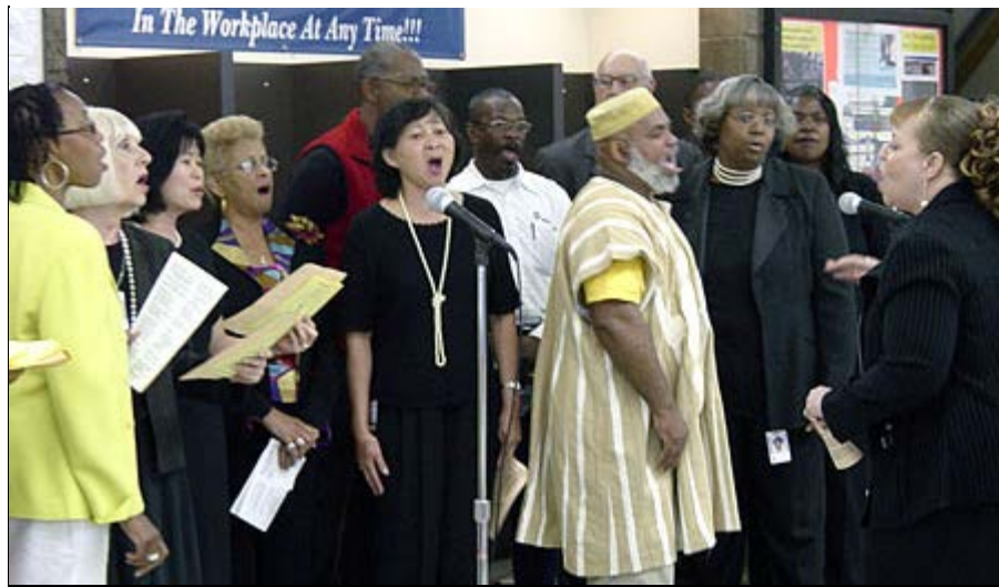
The Metro Choir entertained the crowd with four music selections.