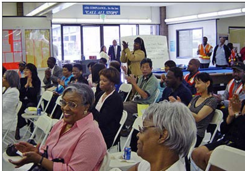
Employees attending the Juneteenth Celebration enjoy the entertainment.