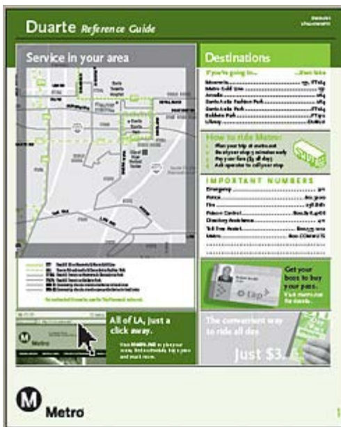
Reference guides, such as the guide for Duarte, pictured above, were distributed to residents in designated areas.

Research conducted after the reference guide campaign, revealed that the likelihood of using Metro increased by 10 percent. There was also a 10 percent increase in unaided awareness of Metro services and products.