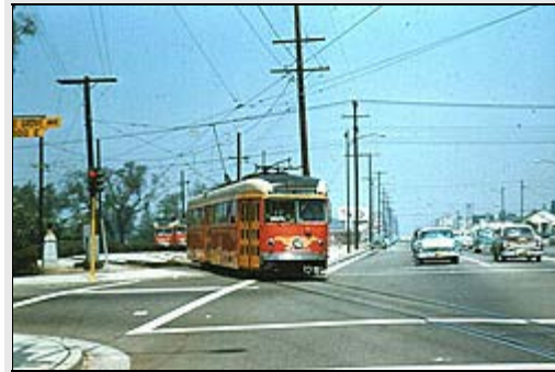
Line 5005 rounds Glenoaks Blvd. at the Orange Grove terminal in Burbank June 4, 1955.