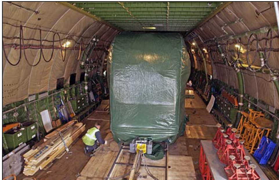
Crews built a miniature railway to roll the 54-ton railcar out off the plane's interior and onto a flat-bed trailer truck.