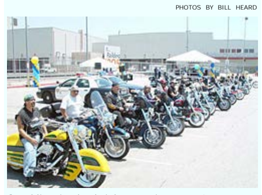
Sparkling in the bright morning sun, 25 motorcycles were on display at Division 20. On cue, members of the "Just Us" motorcycle club revved up an ear-thumping "rolling thunder."

Comfortable temperatures made the environment conducive for families to enjoy the bright, cloudless day.