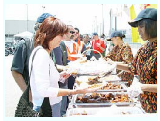
20 yard drew a long line of hungry Raildeo Celebration participants for ribs, hot links, burgers, beans and potato salad.