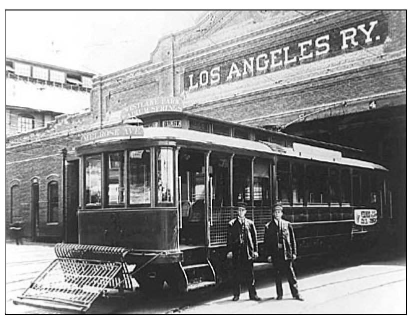
Division 1 circa 1909.

Various entities have operated out of Division 1 over the years, including Los Angeles Railway (1898-1945 - Electric Streetcars), Los Angeles Transit Lines (1945-58 - Streetcars and later Trolley Buses), LA Metropolitan Transit Authority (1958-1964 - all Trolley Buses, then Trolley and Diesel Buses, then all Diesel Buses – Trolley service ended in 1963), Southern California Rapid Transit District (1964-1993 - all buses), and since 1993, the Los Angeles County Metropolitan Transportation Authority, which has converted the majority of the fleet to CNG Buses.