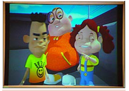
Show awards for Directing, Use of Music, and Public Service and one Cold Award for original and Stay Alive." Three cartoon characters play at a Metro Rail station in the rail safety video, "Look, Listen and Stay Alive."

DVDs that are relevant to particular audiences and could be easily distributed: "Look, Listen, & Stay Alive" appeals to audiences 10 years of age to adult. The video has won 11 national awards: The Aurora Awards—Three Platinum Best of Show awards for Directing, Use of Music, and Public Service and one Gold Award for original