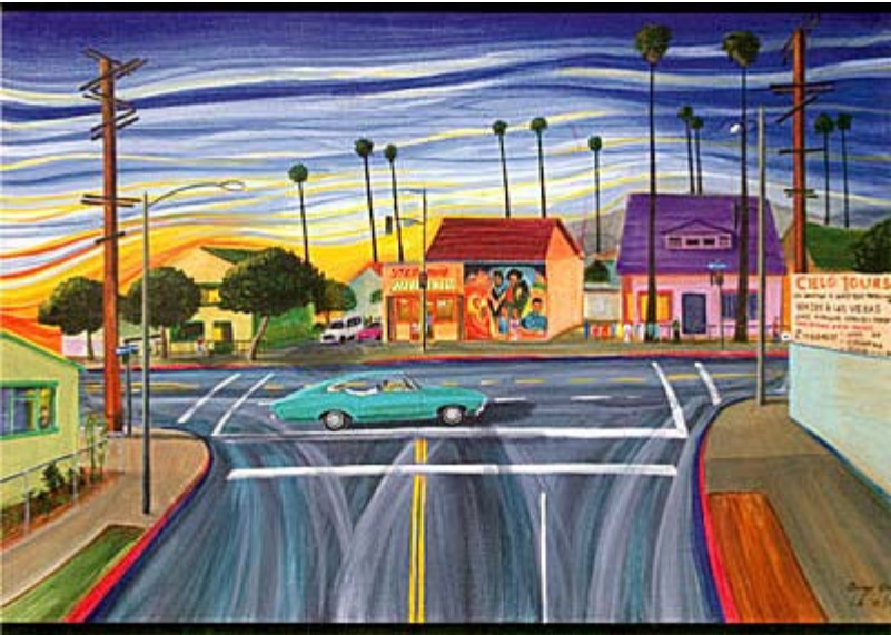
Image of one of Diego Cardoso's paintings is reproduced for group exhibition postcard.