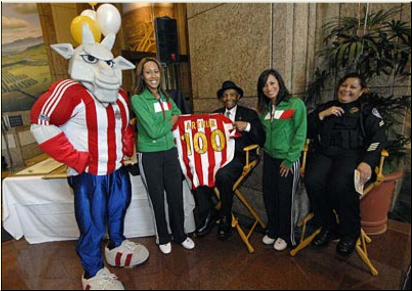
CD Chivas USA group mascot and two of the "Chivas Girls" gave him a team jersey embossed with his name and the magic number 100.