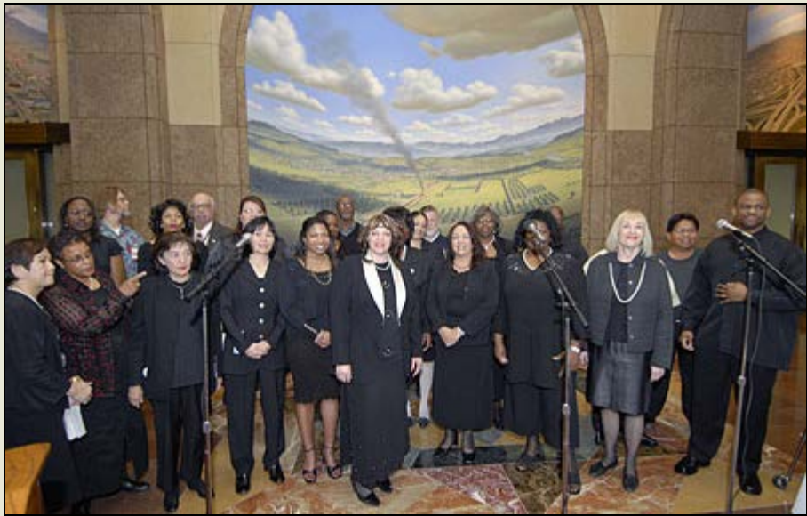
The Metro Choir start the program with a musical tribute, "Total Praise."