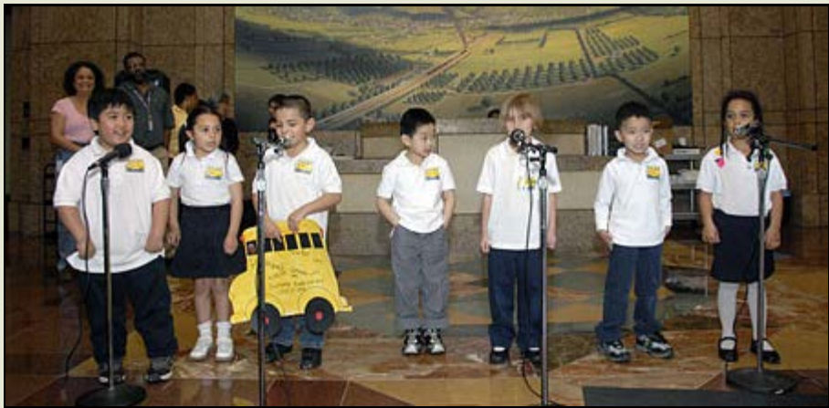
Kindergarten students from the Gateway Child Development Center gave their own rendition of "The Wheels on the Bus."