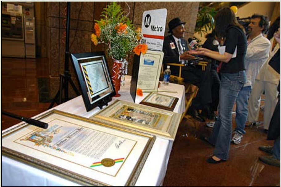
At the end of a table loaded with plaques and commendations, "Inside Edition" crew grabs an interview. Segment is expected to air Friday.