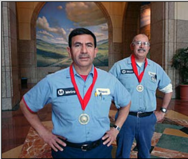
Red Line Fleet men took to the streets: