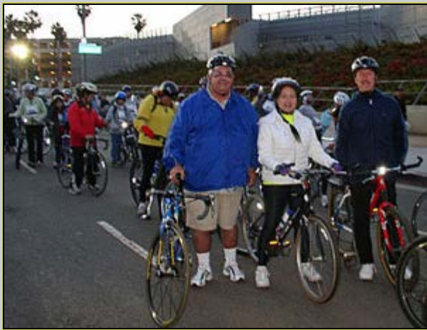
Division 3 bikers crank up for the big race: