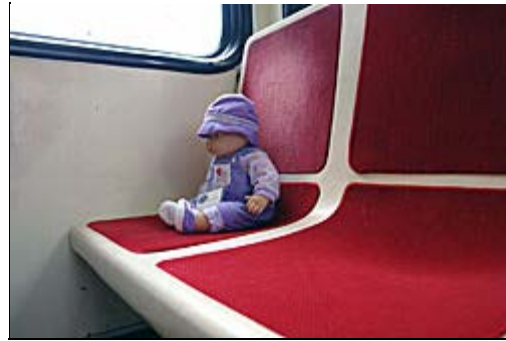
A "lost child" sits forlornly waiting to be discovered by competitors on the Rail Rodeo test train.