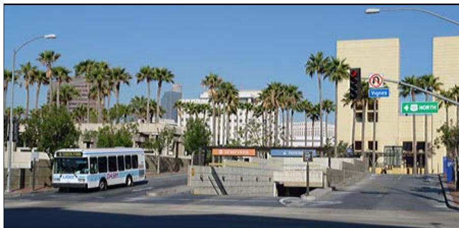
The south entry to the Gateway parking structure will become the main vehicle entrance.

The parking entrance on Cesar Chavez Avenue will remain open for Metro employee vehicle entry and exit, with an access card, 24 hours a day, seven days a week. Visitors may enter the parking garage through that portal on the same schedule, but can use it as an exit only between 8 a.m. and 9 p.m. on weekdays.