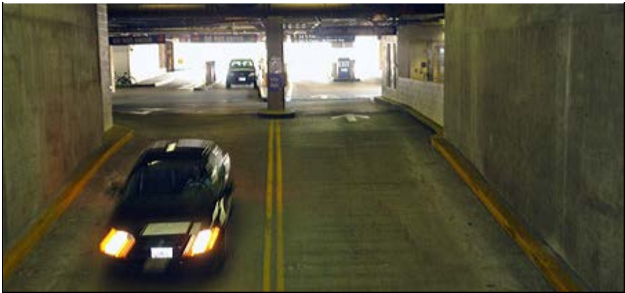
The north ramp from P-1 to P-2 will be closed July 31.