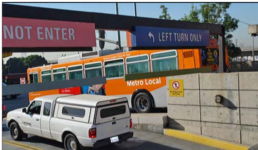
The exit from the south parking portal allows left turns only onto Vignes Street.

Soto reminds drivers exiting from the south entrance that they can only turn left. It is illegal to either go straight ahead onto Ramirez Street by Denny's or to turn right to enter the northbound 101 Freeway.