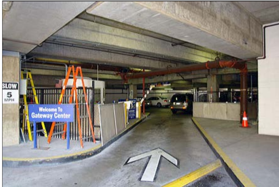
Six-foot steel vehicle gates with card readers are being installed in the south parking structure entrance.

The turnstiles, almost four feet high with 36-inch wide, ADA-compliant entrances, will be equipped with hinged bars that drop to admit an authorized person. Programmed for a "throughput" of 30 people per minute, the turnstiles will be operational July 24.