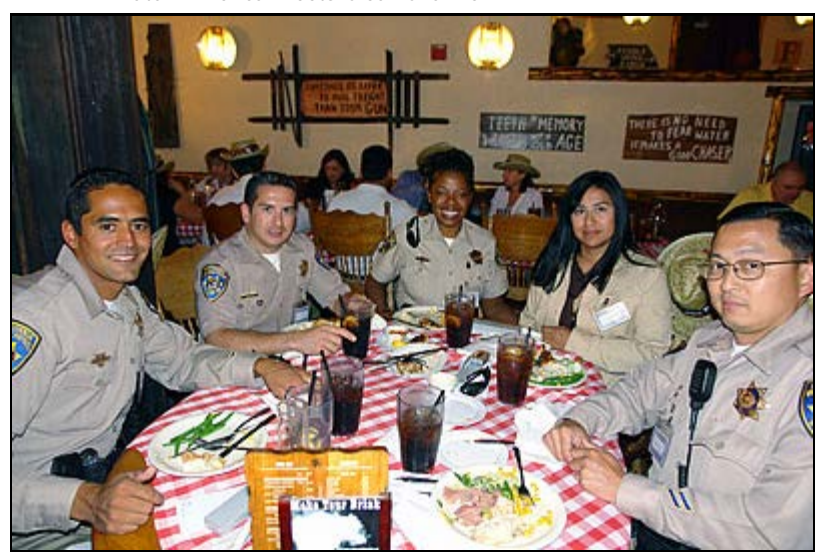
CHiPs - ready to roll when the traffic gets tough.