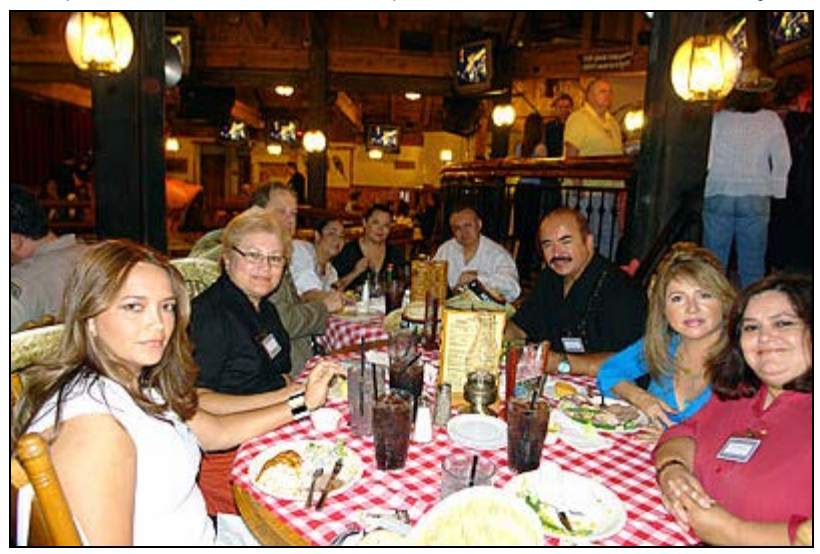
Think: AirWatch America meets Clear Channel