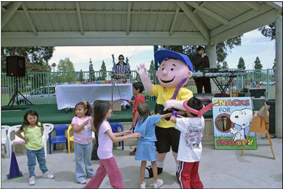
Good Ol' Charlie Brown was on hand to greet kids and grownups, alike, during the Family Day picnic.