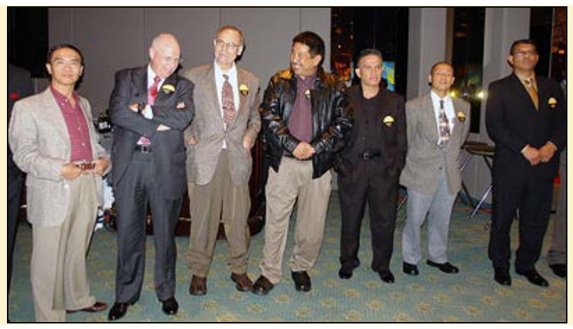
Waiting in the wings: Metro Rail award winners line up for the stage.

Home | Phone Directory | Forms Online | FIS Online