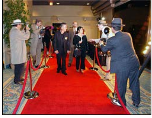
Operations 'stars' get the star treatment on the red carpet