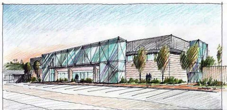
TRANSPORTATION BUILDING • WESTSIDE VIEW

The Division 3 Transportation Building will be reconstructed inside and out, adding life to the nearly 30-year-old structure. Presently, the building is U-shaped, with a two-story side, a single story in the middle and another two-story side. But the two-story sides aren't connected to each other directly – the planned upgrade will fix that. The employee parking structure will also be lengthened to create more spaces in the jammed parking lot.