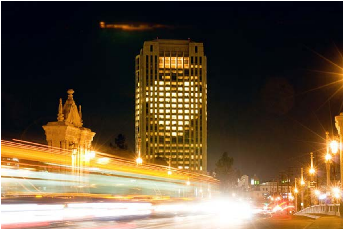
The view from Mission Street Bridge