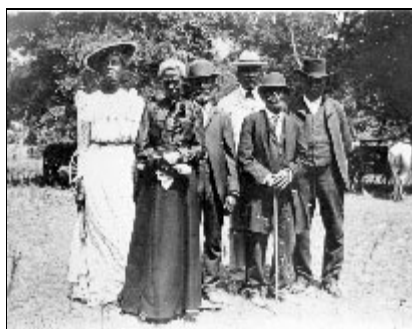
A Juneteenth celebration on June 19, 1900 in Austin, Texas. More at Wikipedia

The celebration will be held at noon on Wednesday, June 18, in the MWD Courtyard Patio, adjacent to Union Station. The Texas-style barbecue luncheon will be served for a nominal fee. Free to all comers, AAEA will serve traditional dessert -- strawberry soda and sweet potato pie.