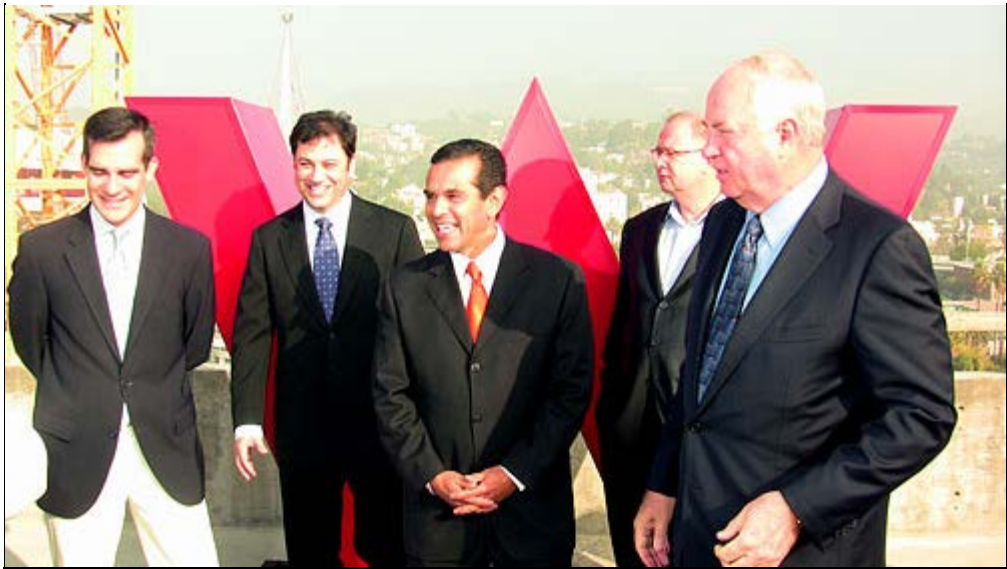
On top of 'W': from left, Los Angeles City Council President Eric Garcetti, television personality Jimmy Kimmel, Mayor Antonio Villaraigosa, and '1600 Vine' developers from Legacy Partners.

The $600 million development project called 1600 Vine will include a new 305-room W Hotel, 143 W residences, 375 luxury apartments (including 78 affordable units), about 50,000 square feet of retail space and transit plaza improvements at the Hollywood/Vine Metro Red Line Station.