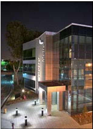
Metro San Gabriel Valley headquarters building

A ribbon and cake cutting ceremony marked the official opening of the $13-million, three-story, 45,515 square-foot Metro San Gabriel Valley's eco-headquarters building. The facility was built to meet LEED Silver Certified environmental standards but surpassed that goal to achieve LEED Gold Certification rating from the U.S. Green Building Council. The building surpasses the state's energy standards, consuming 33 percent less electricity than a conventional structure. The building houses the Metro San Gabriel Valley Sector offices and transportation offices, including a field office for the Los Angeles County Sheriff's Transit Services Bureau.