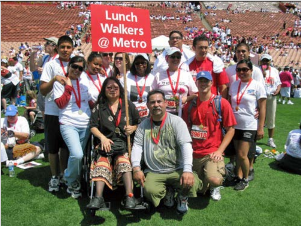
The Lunch Walkers @ Metro team joined forces for the Revlon Run/Walk May 9 at Exposition Park.