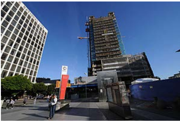
Students got a sneak peek at the Solair Western, a transit oriented development which is nearing completion here.