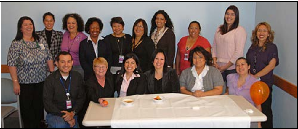
Salad days: With soup in the crock pot and fruit for dessert, the Lunch Walkers' salad bar tops the nutrition charts, tastes better than anything, and makes everyone smile the rest of the day.

The event is the culmination of the Lunch Walkers' weekly salad lunch events, at which members take turns buying and creating salads to get each other to eat healthier during the work week.