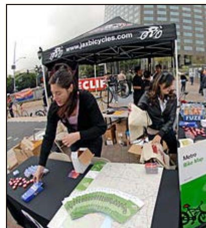
BIKE PIT STOP STATIONS

Riders will congregate on the plaza of the Civic Center Metro Red Line Station starting