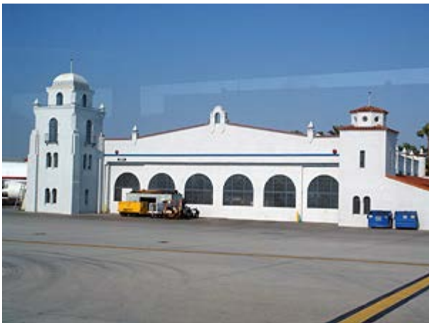
As part of their tour, students cruised through the LAX hangars and cargo terminals.