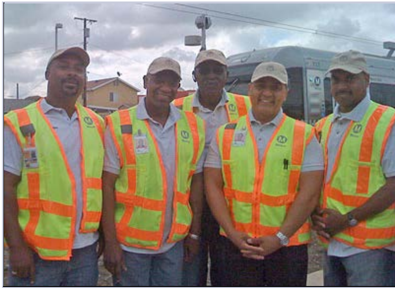
ambassadors working to educate pedestrians, motorists and bicyclists on how to practice safety around the new Gold Line Extension.