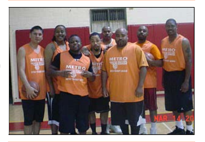
TEAM: Orange Crush