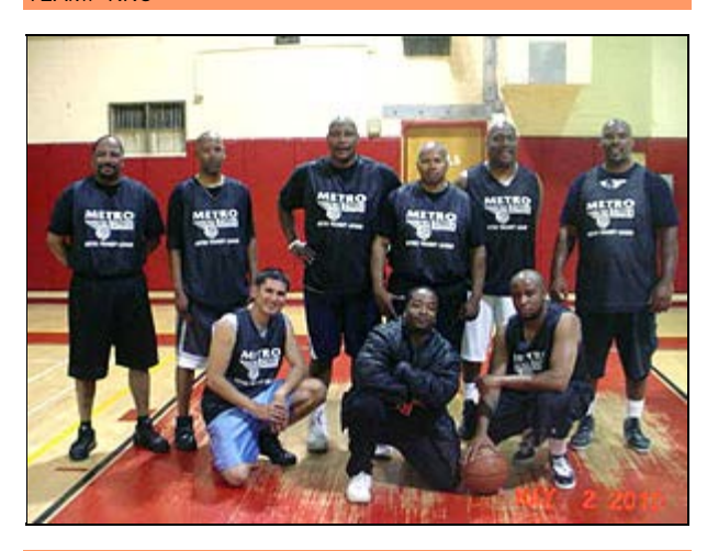
TEAM: Black Magic