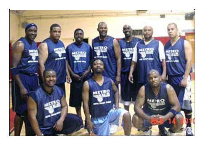
TEAM: Div. 3207

The second game on the bill saw the undefeated Div. 3207 team wave its wand and make the Black Magic disappear into thin