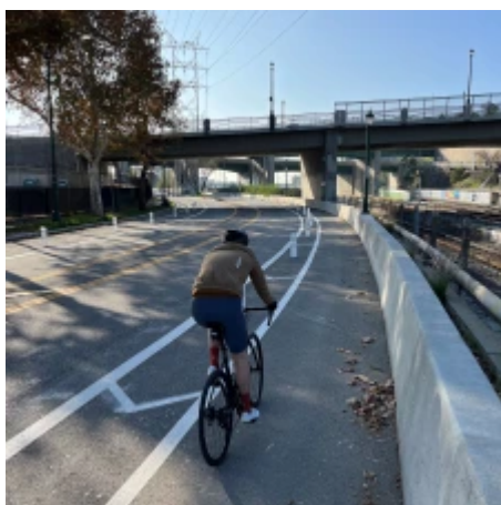
Eyes on the Street: New Bike Lanes on Avenue 19 and First Street