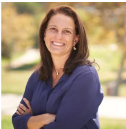
Some Actionable Transportation Ideas for L.A. City Councilmember-Elect Katy Young Yaroslavsky