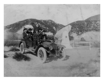
Dedication of Pioneer Monument at the Cajon Pass, 1917.

Later explorers would discover the usefulness of the Cajon Pass as a link between coastal Southern California and the Mojave Desert.