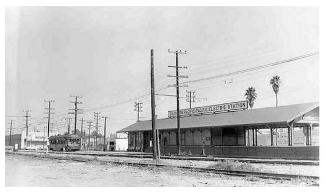
The depot in 1952