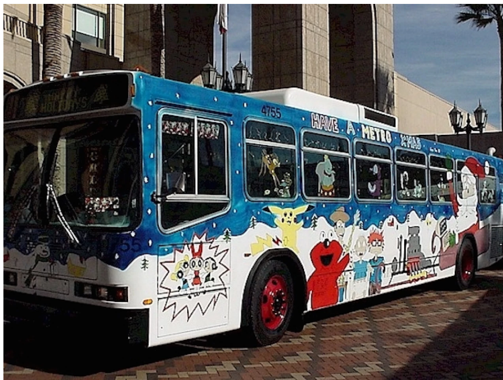
Division 18's (Carson) Entry for the Holiday Bus Decorating Contest

Here's to wishing Metro will get inspired and bring back the candy cane stripes for next years holiday season.