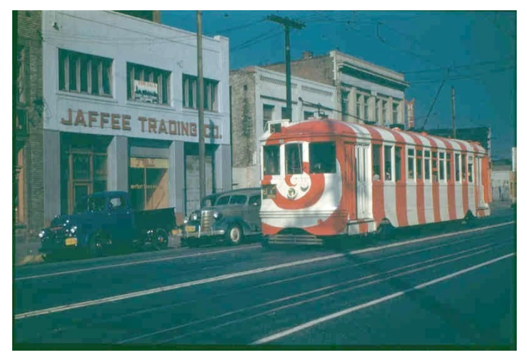
1940s: Holiday Candy Cane Streetcar Type H4