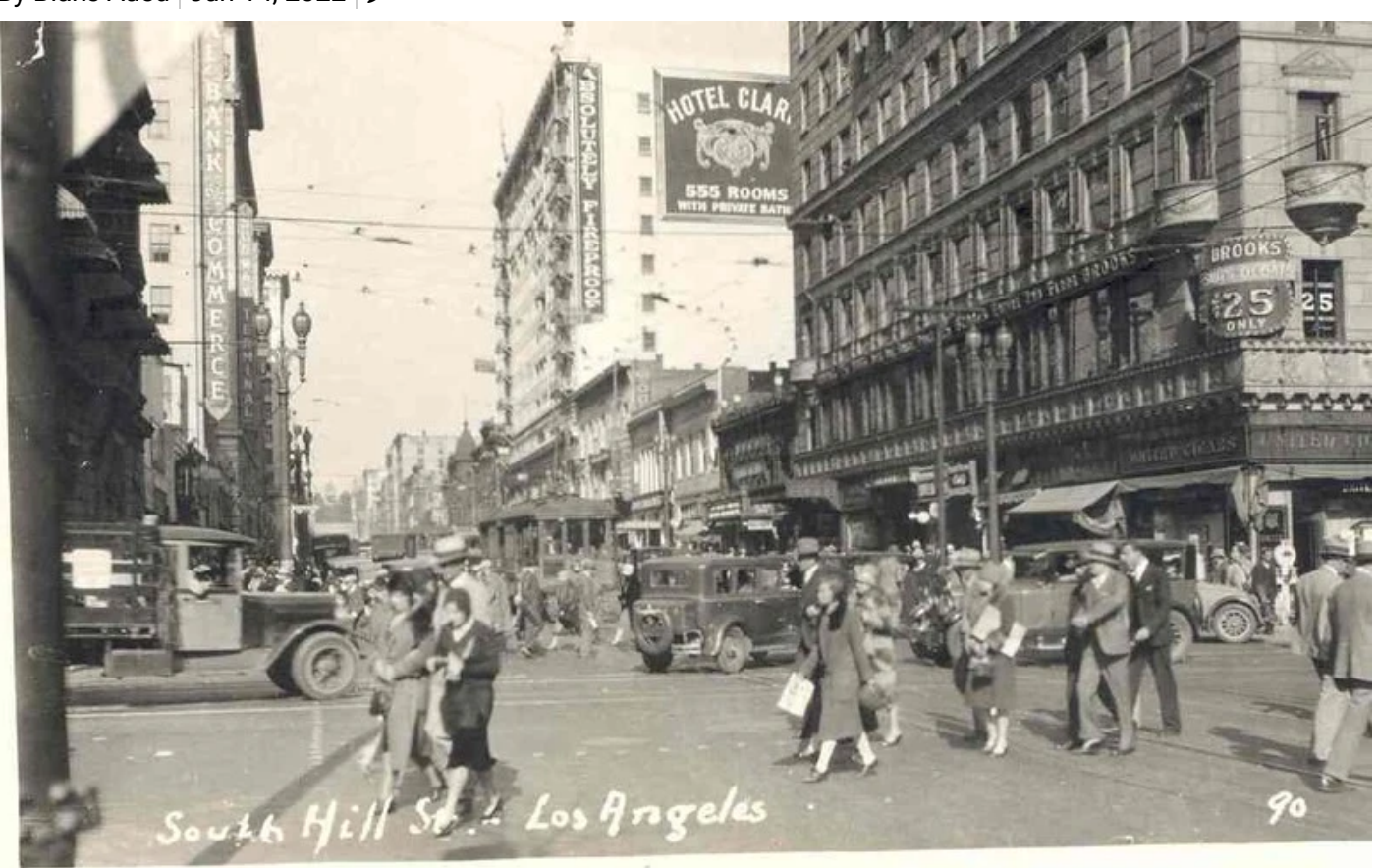
A street in 1920s Los Angeles.