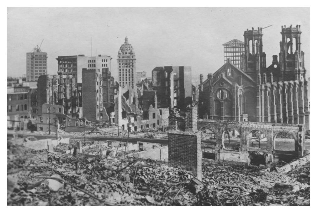
San Francisco after the great earthquake and fire, April 1906

"These records are created in connection with the day-to-day functions of public offices, but many of them . . . have value for purposes for which they were never intended . . . Records of local government constitute America's cupboard of unspoiled goodies . . . the richness of which is concealed by their classification as simply 'old records'. These hundreds of millions of documents have suffered in varying degrees – from natural deterioration, from the elements, from vermin, from theft, from human neglect or deliberate destruction – but those that remain in the county courthouses and city, town, and village halls of the nation conceal the unwritten and unknown history of America."