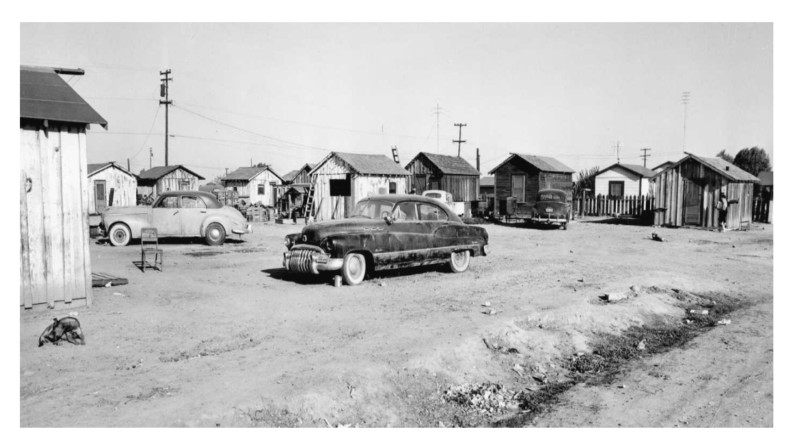
Farm labor camp, Fresno County, ca. 1960s