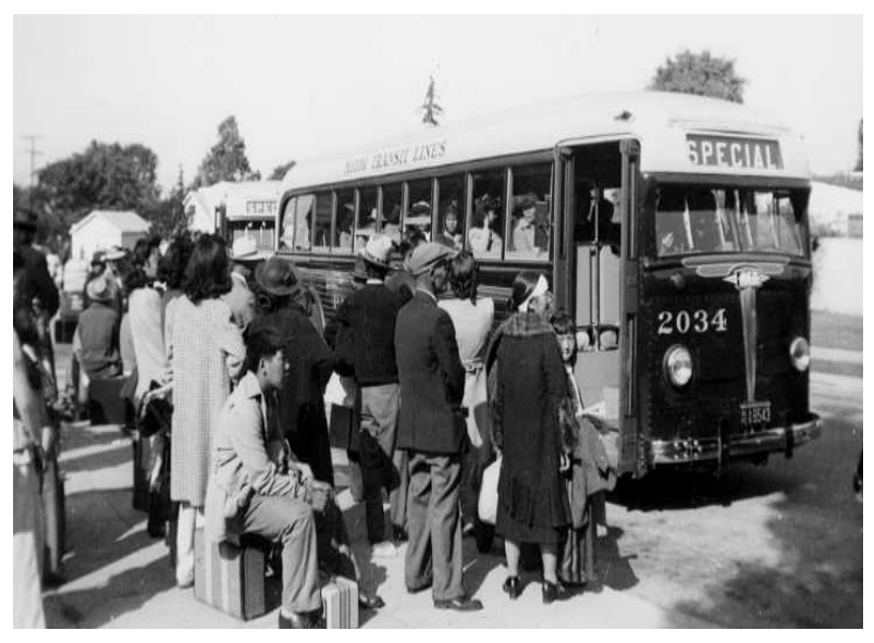
Japanese residents of Los Angeles County board a bus for a relocation center, 1942.

Research Note: Useful source of cartographic information on department activities. Helpful in understanding reports and studies. Also provides information about property boundaries.