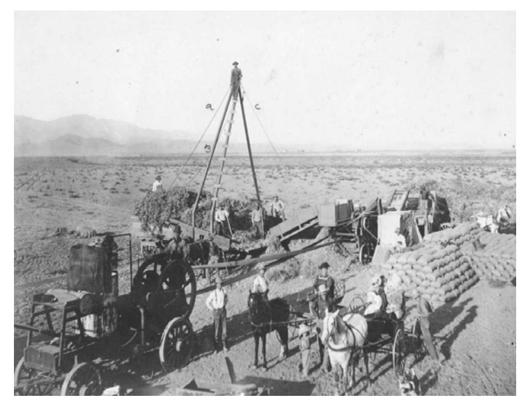
Harvest time near Santa Ana, Orange County, 1915

Research Note: Source for study of finances in general and for specific investigations of agency expenditures and revenues, purchasing patterns, and rising cost of goods and services.