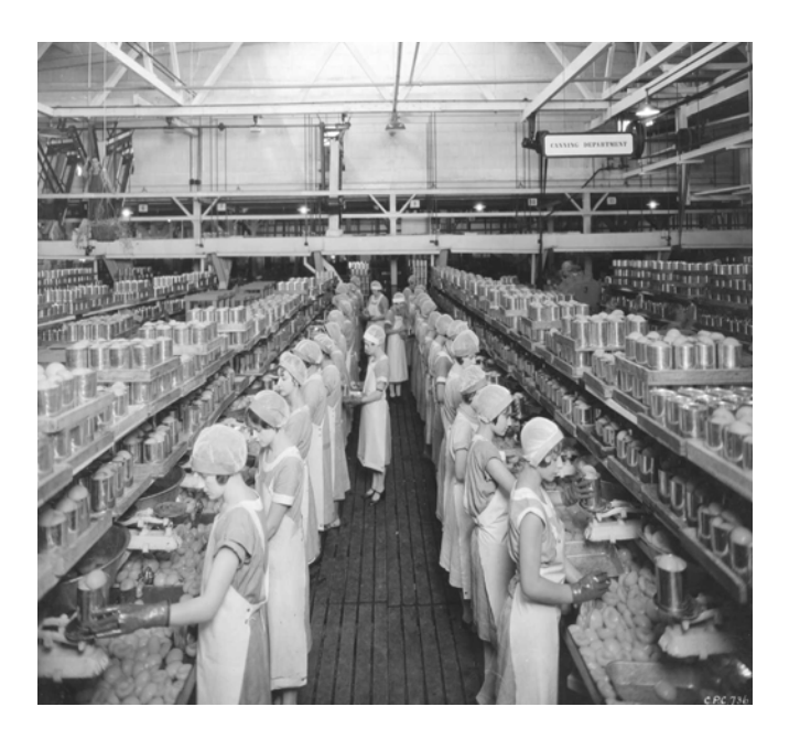
Canning peaches, San Joaquin Valley, ca. 1920s

Research Note: Useful source for a study of legal positions as a basis for county policy and for analysis of types of issues brought to district attorney's office for evaluation.