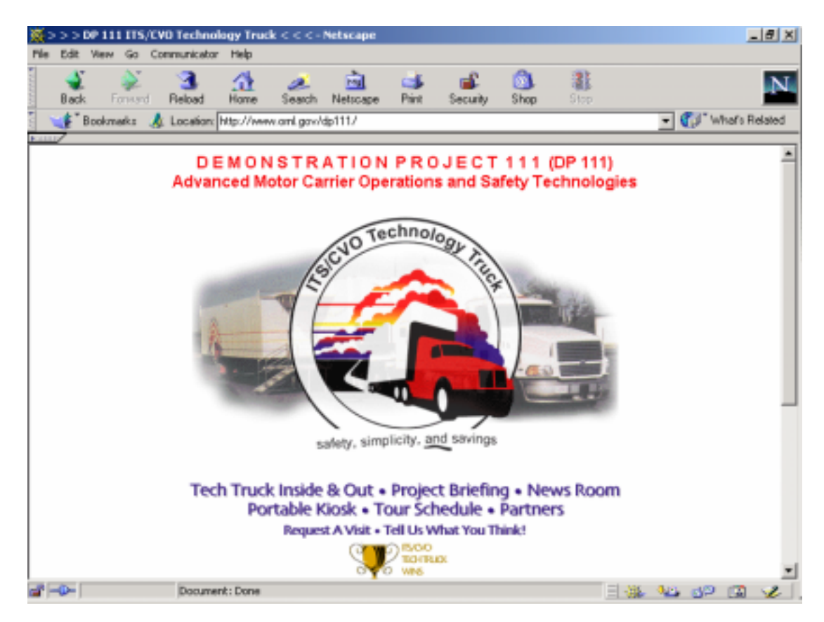
Fig. 7. View of the Technology Truck website homepage.