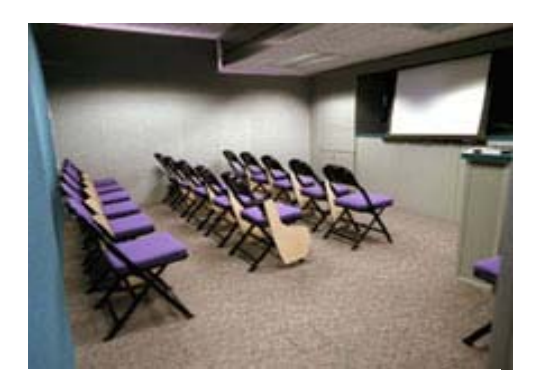
Fig. 2. Multimedia classroom.

The Technology Truck featured a multimedia classroom, which was equipped with a projection system supported by a computer and VCR and had seating for 20 participants (Fig. 2). The classroom also featured soundproof walls so that briefings could be held simultaneously with hands-on workshops, thereby maximizing the use of space and time.