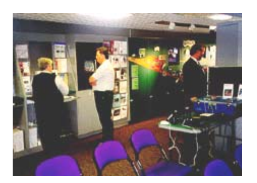
Fig. 6. Hands-on demonstrations.

The hands-on demonstration areas gave the participants the opportunity to interact with technologies firsthand and observe their capabilities. The hands-on demonstration area was divided into two sections, the computer area and the tabletop areas. The computer area included two computers with interactive software featuring logistics, weather, routing and mileage, tracking, communications, vehicle diagnostics, compliance, fleet management, public safety software for roadside enforcement activities, and other software. The tabletop areas included on-board driver- and systems-monitoring