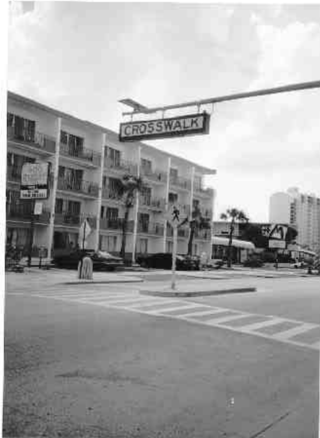
Figure 1. Experimental Site—Daylight, Gulfview Boulevard at 5 th Street, Looking South.