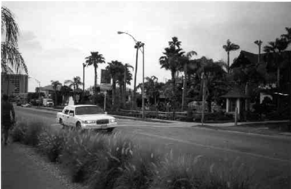
Figure 4. Control Site 4, Mid-Block S. Gulfview Boulevard, Looking North.