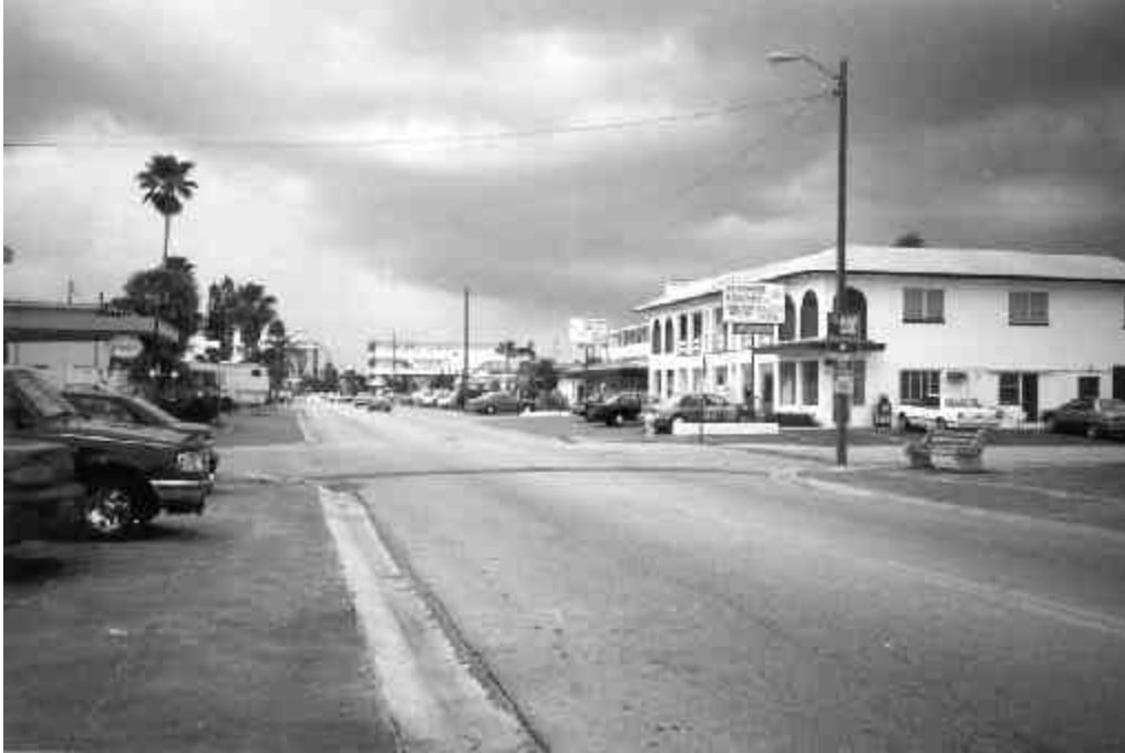
Figure 3. Control Site 2, Coronado Drive at 3 rd Street, Looking South.