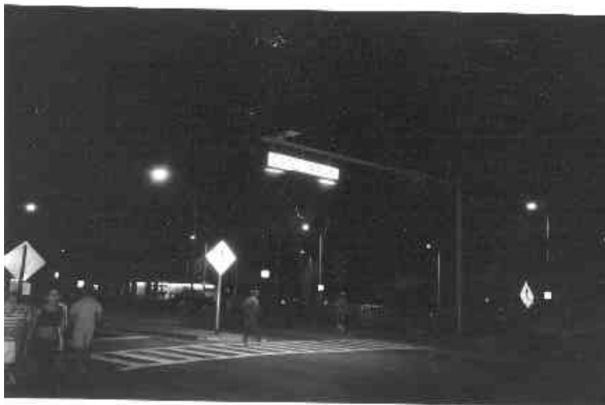
Figure 2. Experimental Site—at Night, Gulfview Boulevard at 3 rd Street, Looking South.