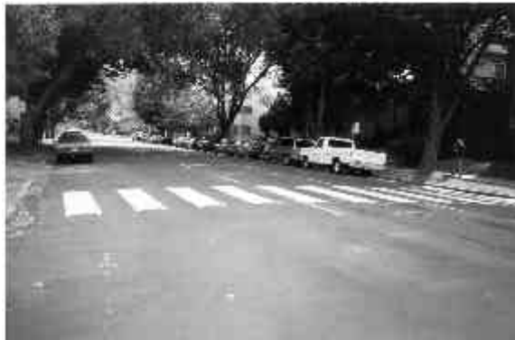
Figure 3. Sacramento Site No. 3 N Street at 18 th Street