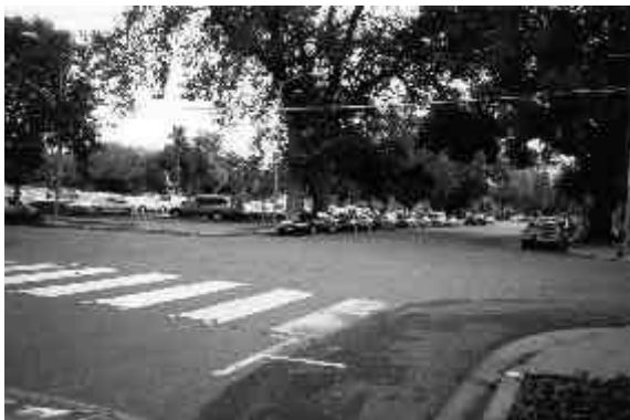
Figure 2. Sacramento Site No. 2 O Street at 14 th Street