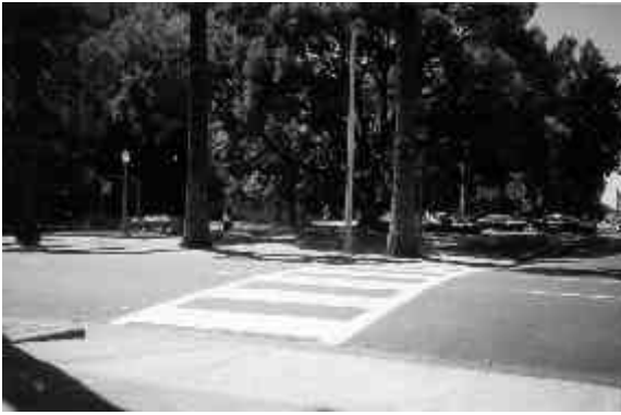
Figure 1. Sacramento Site No. 1 10 th Street at Capitol Mall Drive