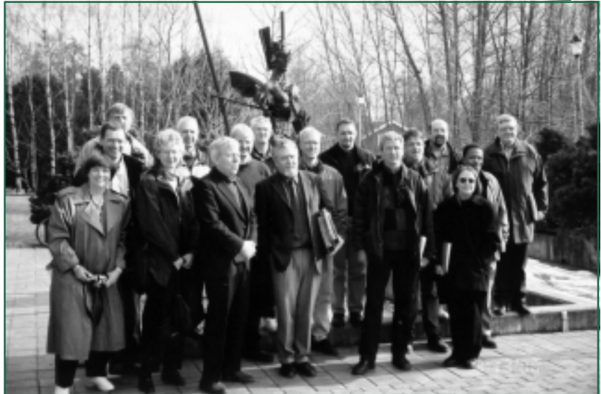
Figure 6. Right-of-Way and Utilities scanning team members and their Norwegian hosts visited the Agricultural University of Norway in As.

Most of the top-ranking staff members in the NPRA's Land Acquisition and Real Estate Division are graduates of the Agricultural University of Norway. The university has 2,000 students in a five-year program that covers property rights and land law. In Norway, a student must complete 13 years of schooling before entering college, which means a university graduate has 18 years of formal education. The university program in land use planning dates back to 1898. The university has offered a curriculum leading to a career in right-of-way and land consolidation since 1960. It also offers master's degree and Ph.D. programs in land use planning.