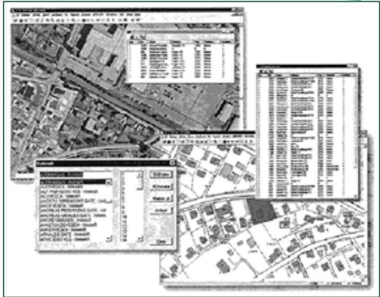
Figure 8. The Norwegian highway agency uses GIS software for right-of-way mapping.

Consideration is being given in England to accommodating fiber optics and wireless telecommunications towers in exchange for cash or services.