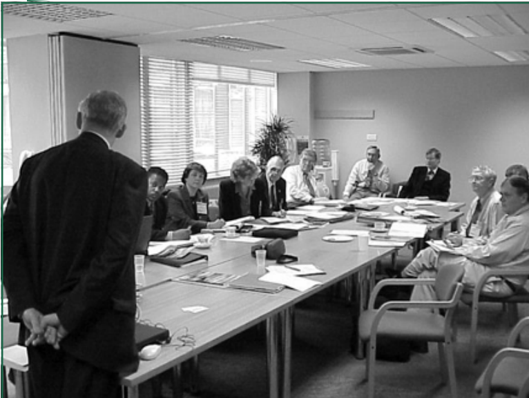
Figure 2. The Right-of-Way and Utilities Scanning Team meets at St. Christopher House in London.

During meetings in each host country, the team identified many interesting right-of-way and utilities practices that may be of value for implementation in the United States. The following chapters present these findings in the categories of appraisal and acquisition, compensation and relocation, training, utilities, and project development. The chapters include findings the team believes have the greatest potential for U.S. implementation. Other observations include items that may have implementation value in specific instances. Recommendations and implementation strategies are included in the final chapters.