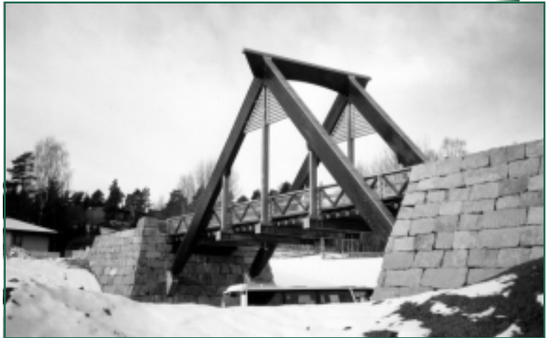
Figure 3. The Norwegian highway agency built a bridge to allow safe access to a farm and preserve it for the community's benefit.

In the countries visited, practices used to provide for more property owner input included early involvement of property owners in the design process and an extensive property owner interview process. Allowing one person to serve as appraiser and negotiator reduced the number of people contacting the property owner. Reducing the need for appraisal reviews and passage of special legislation allowed property owners to receive more timely offers. These actions underscored the objective of providing a fair and equitable method for acquiring right-of-way.