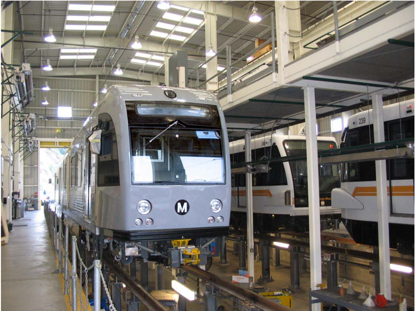
The first rail car was delivered to Los Angeles on June 15, 2005.