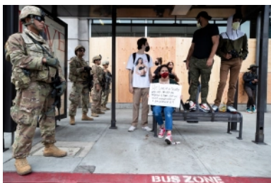
Demonstrators stand in a bus stop surrounded by members of the National Guard during a march in response to George Floyd's death on June 2, 2020 in Los Angeles.

Officials asked for a report on the creation of the task force to be completed within 90 days.