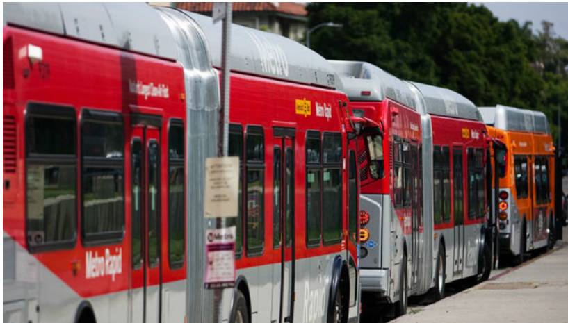
Metro buses stopped at a bus stop.

The Los Angeles County Metropolitan Transportation Authority's board of directors Thursday will consider appointing a committee to rethink public safety on the agency's transit system, including alternatives to armed law enforcement response to some incidents.